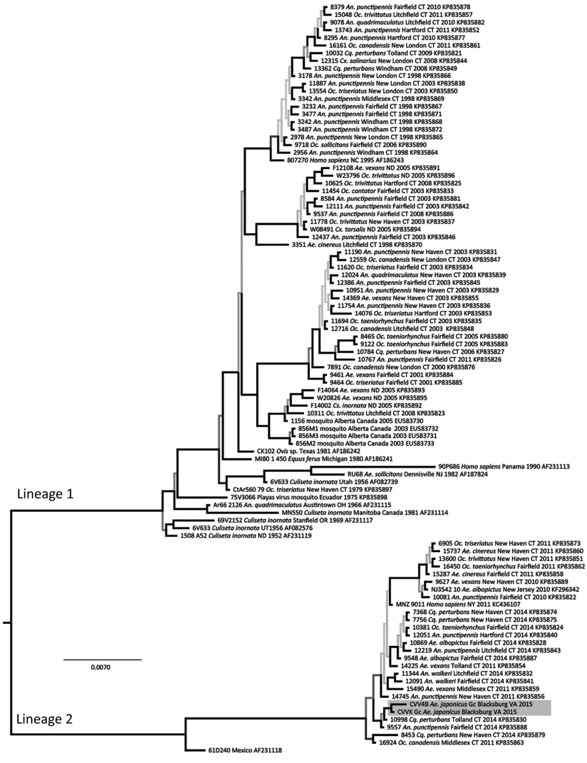
Figure 2. Phylogeny of Cache Valley virus (CVV) isolates in mosquitoes collected in Blacksburg, Virginia, USA (GenBank accession nos. KX583998 and KX583999), and reference isolates. The tree was inferred from the medium RNA segment of the virus polyprotein gene and estimated by using mixed model partitioned Bayesian analysis. State, year, host, and GenBank accession number are listed for each isolate. Historical lineages (1 and 2) of CVV are indicated. Shading in lineage 2 indicates strains isolated in this study. The closely related Fort Sherman virus from Panama (accession no. AF234767) is not included. Scale bar indicates expected nucleotide substitutions per site. Ae., Aedes ; An., Anopheles ; Cq., Coquillettidia ; Cx., Culex ; Oc., Ochlerotatus .