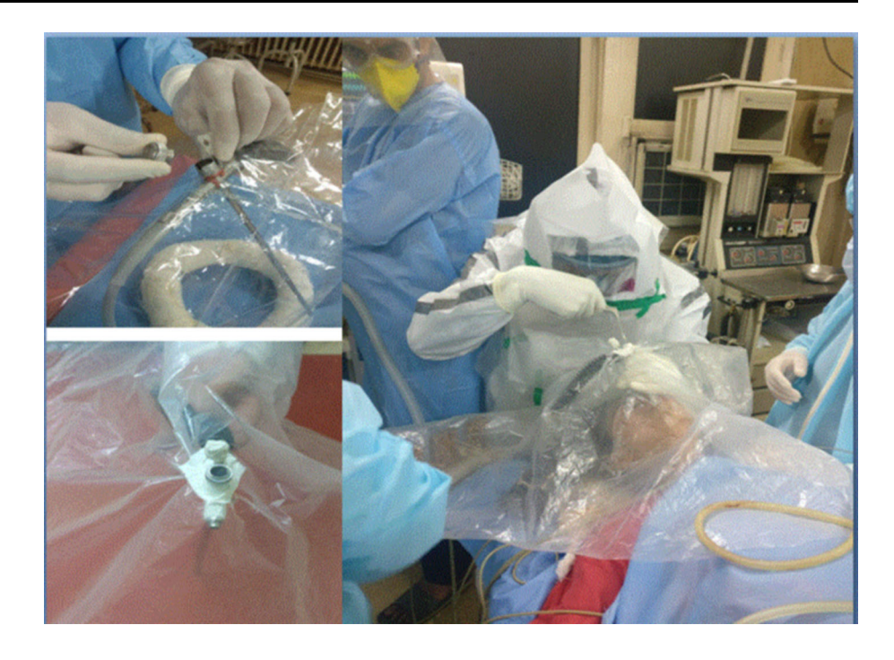
Fig. 5 A transparent polythene sheet is attached to bronchoscope so that the sheet covers face, neck, shoulders and anesthetic circuit and Fiberoptic cable attachment. Also seen is a glass cap that is attached to working channel opening for closing the circuit when saturation starts dropping

The number of times forceps were inserted to remove foreign body was two times in case 1, three times in case 2,3,5 and 4 times in case 4.