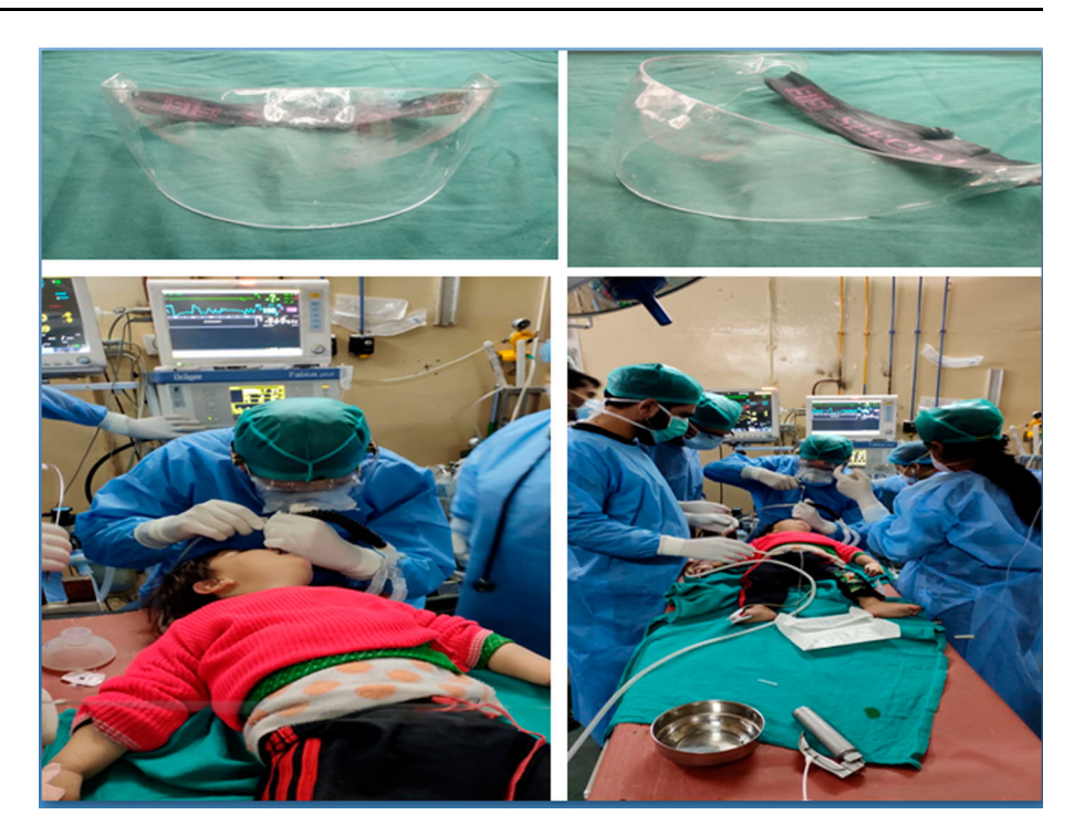
Fig. 2 Showing Full gown but not water proof and local made facial shield as an additional protection used in second bronchoscopy. Also see that surgeon is very close to jet of air/aerosols while doing bronchoscopy

Fig. 1 Showing simple gown and head cap used in first bronchoscopy. Also shows glass of scooter helmet used in first bronchoscopy as an additional protection. Also see that surgeon is very close to jet of air/aerosols while doing bronchoscopy