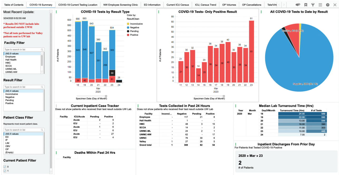
Fig. 2 COVID-19 incident command dashboard. UW Medicine IT services created a dashboard for our COVID-19 hospital incident command. A list of metrics collected can be found in Table 1 .