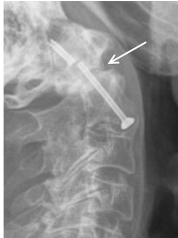
Figure 3 Lateral radiographs obtained 6 years after anterior screw fixation in a 77-year old man who suffered a type II odontoid fracture after fall of 3 meter. The image demonstrates a pseudarthrosis at the base of C2 with a breakage of the screw.

and d'Alonso classification were most common in people aged 70 years and older [18].