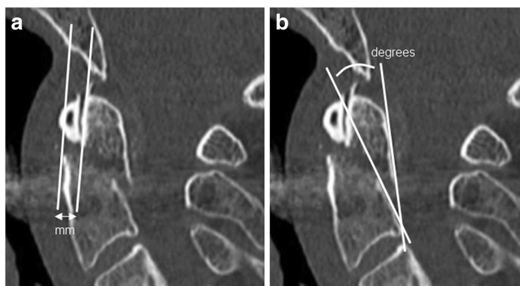
Figure 1 Standard measurement technique of odontoid fracture displacement (a) and degree of fracture angulation (b).

whereas there were two multiple injured patients in the posterior fusion group.