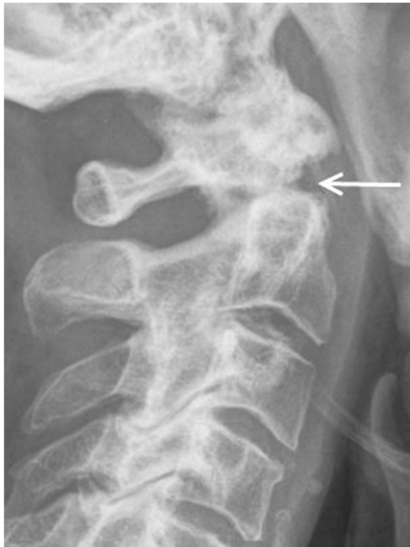
Figure 2 Lateral radiographs obtained at 3-year follow up in a 77-year-old man who suffered a type II odontoid fracture after a car accident and was treated non-operative. This image demonstrate lack of fusion.