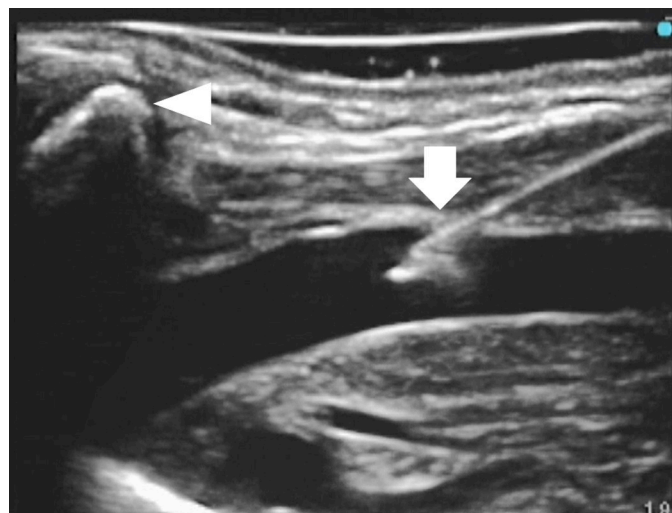
Fig 3. The long-axis view of the internal jugular vein and the needle. The transducer is positioned over the clavicle (arrowhead), and the internal jugular vein and the needle (arrow) are visualized clearly.

In our previous study, the long-axis in-plane approach resulted in approximately 30% reduction of the posterior wall penetration rate compared to the corresponding after performing the short-axis out-of-plane approach in infants and small children [10]. We speculated that the effect of the combined approach on reduction of posterior wall penetration is