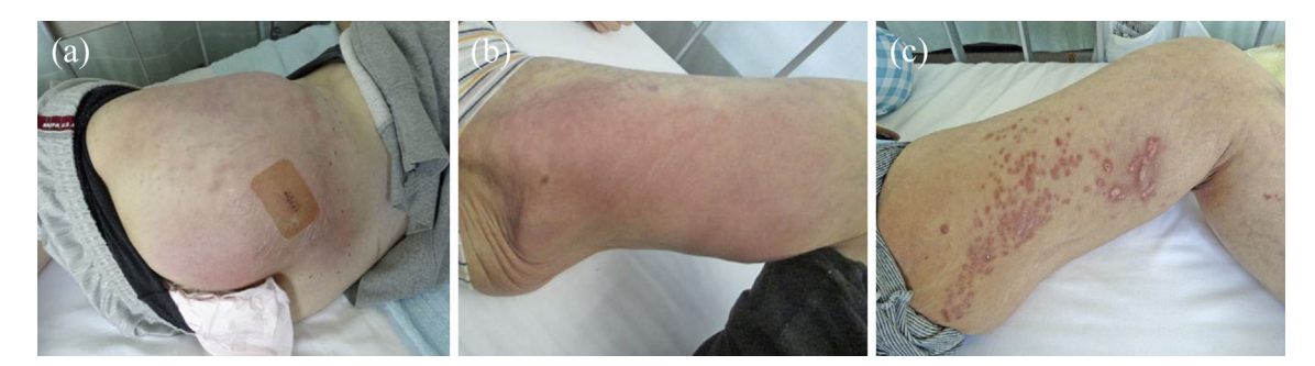
Figure 1. Skin lesions of the buttock and the thigh. (a) Broad erythema on the left buttock (after a biopsy). (b) Erythema on the inside of the left thigh at the time of relapse. (c) Multiple subcutaneous indurations after four months of combined antibiotics treatment from the time of relapse.