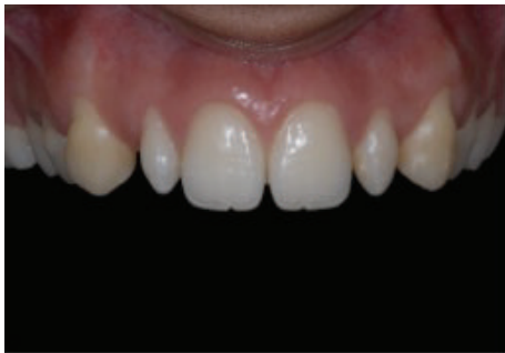
FIGURE 6: Appearance 4 months after clinical crown lengthening to correct the gummy smile, reprinted with permission.