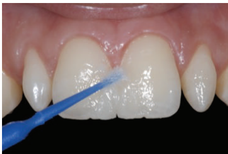
FIGURE 9: Removal of excess cement with a disposable brush and dental floss before light activation. Care should be taken so that the fragments do not change position, reprinted with permission.

the right side (lingualization of the first and second upper premolars) was corrected with no-prep veneers (Figure 11), and enameloplasty on the distal surface of right upper canine was accomplished (Figure 11). Figure 12 shows the final result.