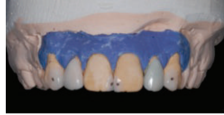
FIGURE 7: No-prep veneers for upper lateral incisors and ceramic fragments for canines and central incisors, reprinted with permission.