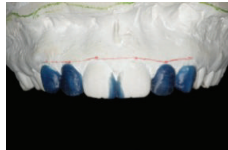
FIGURE 4: Diagnostic wax-up, reprinted with permission.

as to develop the original emergence profile of the teeth [3]. The perfecting of current ceramic systems, especially pressed ceramics reinforced with lithium disilicate, has brought us back to the idea of no-prep veneers. Although these veneers achieve thicknesses similar to those of feldspathic ceramics, lithium disilicate ceramics allow for restorations of up to 0.2 mm in thickness with greater clinical and laboratory ease. Because of their better mechanical properties, these restorations can be made, finished, tested, and cemented more safely [4]. This clinical report presents the case of a patient with conoid upper lateral incisors who was rehabilitated with no-prep veneers and ceramic fragments.