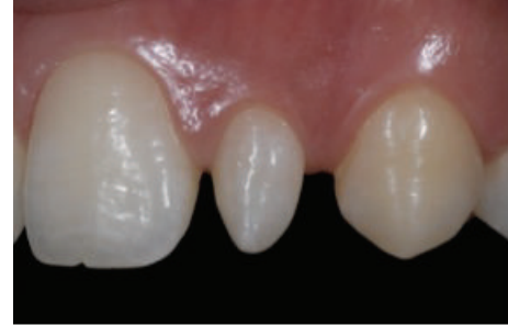
FIGURE 3: Intraoral left lateral view, reprinted with permission.