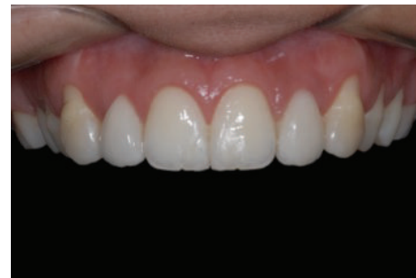
FIGURE 11: Front view of the result of the first phase of treatment. Observe the presence of exposed roots on the upper canines (consequence of the clinical crown lengthening procedure), lingualization of elements upper right premolars, and the rotation of the canine, reprinted with permission.

short-term color stability (pigmentation) and their low resistance to wear and tear (loss of shine and texture and the accumulation of bacterial biofilm) may have a negative impact on satisfaction. In a study of 180 samples of three kinds of veneers (direct or indirect resin and porcelain) cemented onto the front teeth, patients treated with porcelain restorations were significantly more satisfied after 2 years. Porcelain veneers, when made in accordance with proper indications and a precise clinical protocol, offer excellent longevity and appearance [6]. In their evaluation of 318 porcelain veneers cemented in 84 patients, [6] observed a 93.5% survival rate after 10 years. The main cause of failure was fracture of the porcelain. Bruxism and nonvital teeth significantly reduced the clinical lifespan. In a systematic literature review, the main complications found after 5 years were marginal pigmentation and loss of margin integrity [7].