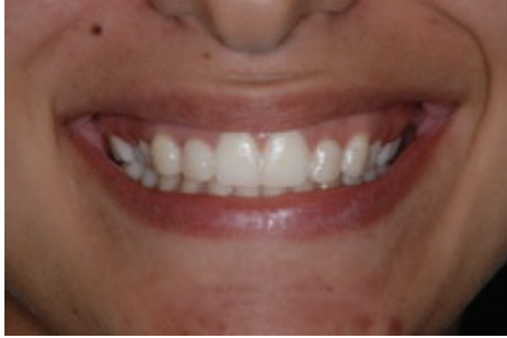
FIGURE 5: View of the smile with the cosmetic mock-up, reprinted with permission.