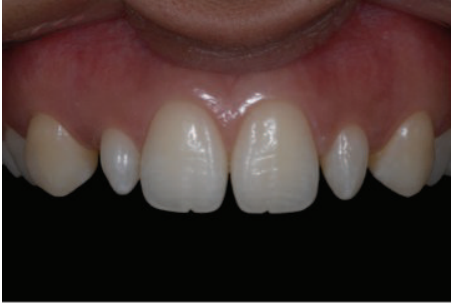
FIGURE 1: Intraoral front view, reprinted with permission.