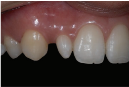
FIGURE 2: Intraoral right lateral view, reprinted with permission.