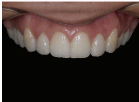
FIGURE 12: Close-up view of the upper incisors. Presence of ceramic fragments on the mesial surfaces of elements central incisors and no-prep veneers on lateral incisors, reprinted with permission.

basically vary in terms of the level of the wear and how the incisal edge evolves. Although there is no evidence as to which preparation technique produces better clinical results, we know that veneers cemented onto dental preparations restricted to the enamel have a longer lifespan [9]. Currently, minimally invasive dentistry encourages avoiding wear on healthy tissue as much as possible. Treatments with porcelain veneers should create only the space needed to provide resistance for the restorative material (0.2–0.3 mm) [10]. In teeth where the color needs to be changed, thicker restorations may be necessary to cover the dental substrate. Thus, the diagnostic wax-up (Figure 5) and the mock-up (Figure 7) are valuable tools to determine the need for and depth of the dental preparation [11]. They represent what we hope to achieve and should be the main focus of all of the planning.