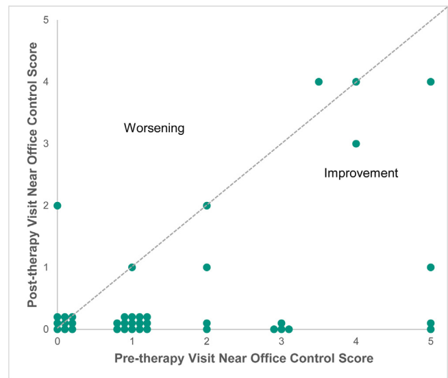
Figure 2 Near Office Control Score before and after office-based vergence/accommodative therapy with home reinforcement in all 40 participants. The mean near Office Control Score was reduced after therapy. A number of points have been offset slightly (up to \pm 0.2 point) to aid visibility.

Although there was no significant change in the angle of distance exodeviation ( p = 0.63 ) after treatment, a sig-