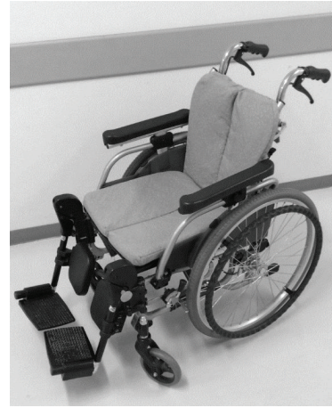
FIGURE 1: Conventional wheelchair (CWC).

2.2. Instrumentation. Three-dimensional (3D) motion analysis (MyoMotion Analysis System; Noraxon USA Inc., Arizona, USA) consists of combined motion sensors, surface