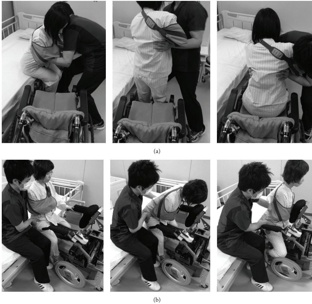
FIGURE 4: Transfer to the CWC and RWC. (a) Patient-handling tasks involved with a CWC can be classified into 3 groups: lifting of the patient, repositioning or turning from the bed towards the direction of the wheelchair, and seating the patient safely in the chair. (b) The RWC involves only 1 transfer step, which is that the assistant pushes the patient sitting on a bed forward in the same position to the seat of the RWC.

recorded during maximum isometric manual test. Mean muscle activity, expressed as %MVC, and mean HR were calculated during both experimental conditions.