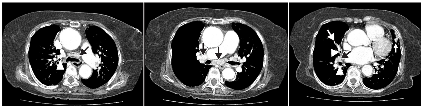
Figure 1. On the computed tomography scan, bronchial anthracofibrosis is characterized by smooth narrowing and thickening of multiple lobar or segmental bronchi (white arrowheads) and calcified lymph node enlargement adjacent to the narrowed bronchi (black arrows) with or without lobar or segmental atelectasis (white arrow).

The diagnosis of BAF was based on the CT findings that fulfilled the following criteria: 1) bronchostenosis that caused smooth narrowing of multiple lobar or segmental bronchi; 2) calcified or non-calcified lymph node enlargement adjacent to narrowed bronchi; and 3) these two criteria which could not be attributed to other causes (Figure 1) 4,5 . All patients were classified into patients with BAF (BAF group) and without BAF (non-BAF group) according to the presence or absence of CT findings consistent with BAF. A variety of clinical variables