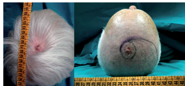
Figure 2. A 78-year-old man with a nodular cSCC (G2; thickness, 2 mm) on the scalp. We performed surgical excision under local anesthesia, with safety margins of 10 mm. The resulting defect was covered with a rotation flap

veloped a surgical wound infection. Weekly dressing was used to treat all these postoperative complications until closure of the wound was achieved. The follow-up (range: 3–25 months) included a clinical examination at every 6 or 12 months during the next 2 years for cSCC in situ, a clinical examination at every 6 months during the next 2 years and an annual ultrasound examination for the next 3 years at T1, T2 (G2) and in addition an annual chest x-ray from T3. During the follow-up, no patient showed the presence of recurrences or metastases.