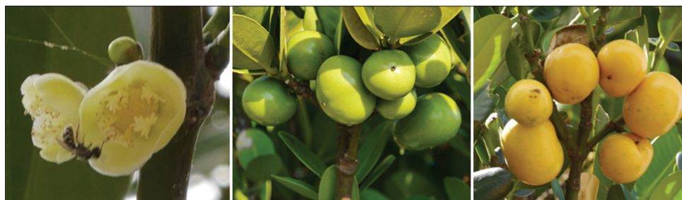
Figure 1: A wasp visiting male flowers (left), young green fruits (middle), and mature orange fruits of Garcinia subelliptica

Benzophenones or phloroglucins are a diverse class of phenolic compounds consisting of more than 300 members and characterized by having a common phenol-carbonyl-phenol skeleton [4,6]. The A ring generally contains up to two substituents while the B ring can undergo prenylation and cyclization producing a wide variety of structurally unique compounds with bi-, tri-, and tetra-cyclic ring systems. Benzophenones are major intermediates in the biosynthetic pathway of xanthenes and are typically found in Garcinia species. They are non-polar compounds that become increasingly hydrophobic with more prenyl groups attached.