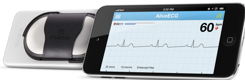
Figure 1 AliveCor heart monitor.

Potential participants will be identified from the cardiothoracic wards by the ward staff in consultation with the research assistant. The research assistant will assess eligibility against the inclusion/exclusion criteria, and approach all eligible participants during their inpatient stay. The research study and the commitment involved will be clearly described in lay terms. Potential participants will be afforded every opportunity to ask questions about the study without prejudice, and to choose whether or not to participate. Participation in the study is entirely voluntary and choosing not to participate will not in any way affect any future treatment. There are no rewards or incentives for participation in the study. The participant will be enrolled into the study after the informed consent process has been completed. As this is