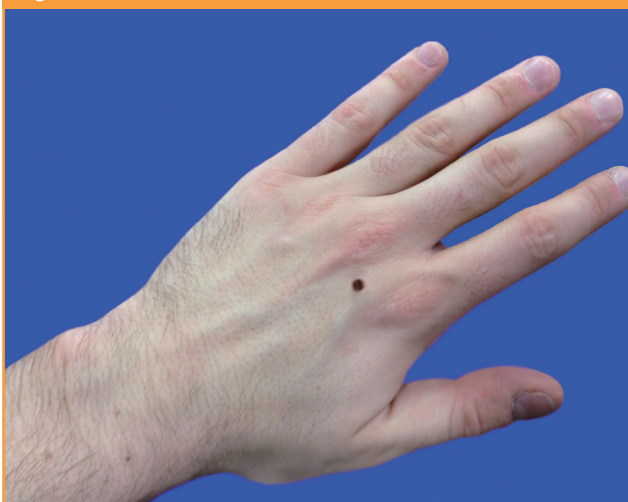
Fig. 1. Circular lesion on the dorsum of the left hand