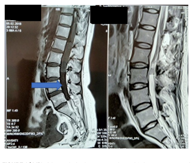
FIGURE 2 | MRI of the cervical spine, preoperative and 2 days post-surgery. A 36-year-old with a Neuroma on the ventral surface of the spinal cord, at the level of C1-C2 (blue arrow). Control MRI shows total tumor removal using an improved method (orange arrow).

interval (95% CI). The significance level was set at p < 0.05, for all analyses.