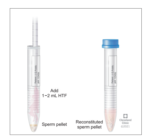
Fig. 6. Reconstitution of pellet with sperm wash media.