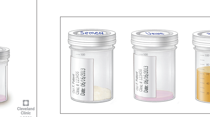
Fig. 2. Semen collection and urine collection containers with sperm wash media.