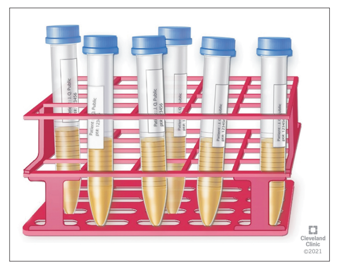
Fig. 3. Transfer of urine sample aliquots into polystyrene centrifuge tubes.

sterile conical tubes and centrifuged at 300 g for 10 minutes (Fig. 3, 4). After centrifugation, the supernatant is discarded from the tube without disturbing the pellet (Fig. 5, 6). Sterile technique is used throughout the reconstitution process. The first tube sample pellet is reconstituted with 1–2 mL of sperm wash media (Fig. 6). Transfer 2 mL of the mixture from the first tube to the second tube and reconstitute the pellet. The process of reconstituted. The final reconstituted pellet obtained after removal of the supernatant is re-suspended in 2.0 mL of sperm wash media and the re-suspended sample is examined for the presence of sperm. The initial urine specimen volume and final volume after reconstitute and final volume after reconstitute of the supernatant is re-suspended sample is examined for the presence of sperm.