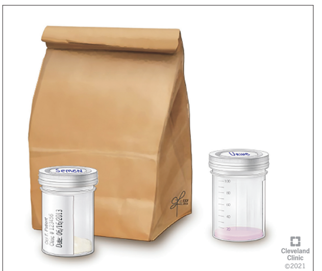
Fig. 1. Semen and retrograde urine sample collection.