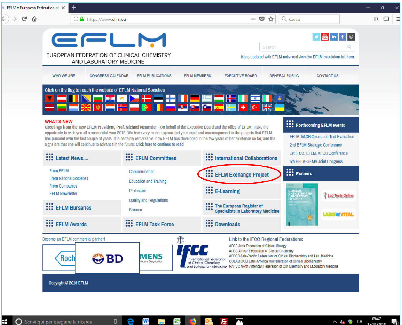
Figure 1 EFLMLabX project on EFLM website

A dedicated website for the EFLMLabX program was developed within the framework of the main EFLM website (Figure 1), offering the possibility to search and apply to the several practical training