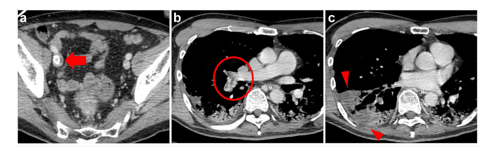
FIGURE 1: Chest-pelvis contrast-enhanced computed tomography images

(a, b) Deep vein thrombosis of the right iliac vein around the drainage cannula for extracorporeal membrane oxygenation (arrow) and pulmonary embolism of the right main pulmonary artery (circle).