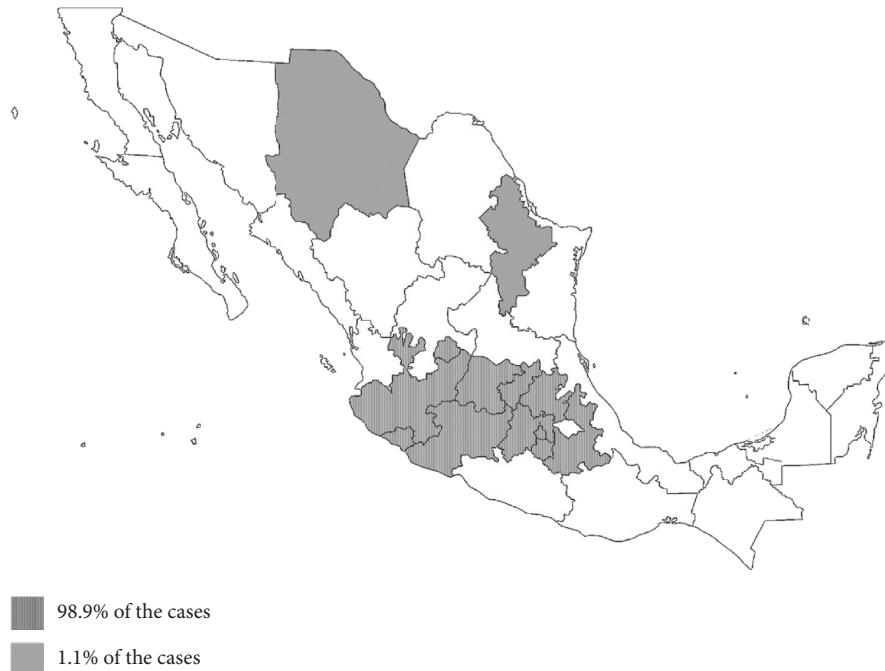
FIGURE 1: Geographic distribution of cases of silica urolithiasis in Mexico.