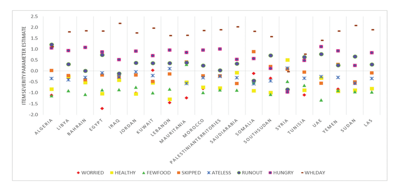
FIGURE 1 Relative severity order of the Food Insecurity Experimental Scale (FIES) items in the League of Arab States (LAS) and individual countries, Gallop World Poll (GWP) surveys 2014 and 2015.

Overall, severe FI was significantly more prevalent among married individuals, rural residents, those with lower educational attainment, unemployed, live in lower income quintile, larger households with more children, and in low PSAVT countries (Table 4). These patterns were similar by HDI categories although the magnitudes of risks were higher