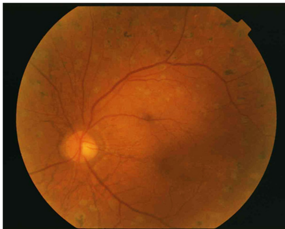
Fig. 3 Postoperative fundus photograph of the patient's left eye. The fundus is now visible, and corrected visual acuity has improved from 0.02 to 0.7 diopters

In age-related macular degeneration and polypoidal choroidal vasculopathy, vitreous hemorrhage may occur due to CNV, but the cause of vitreous hemorrhage in our patient was probably PDR. Diabetes associated with PXE and angioid streaks has previously been reported [8, 9]. PXE usually causes systemic lesions involving medium-sized and large vessels, but systemic microangiopathy has