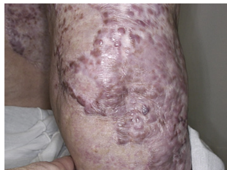
Fig. 1. Elbow right before treatment on June 10, 2013.

The treatment was initially performed with the V-Actor (3,000 pulses per area of approx. two palms at 8.0 Hz). The same area was then treated with the C-Actor at 0.45 mJ/mm 2 , 1,000