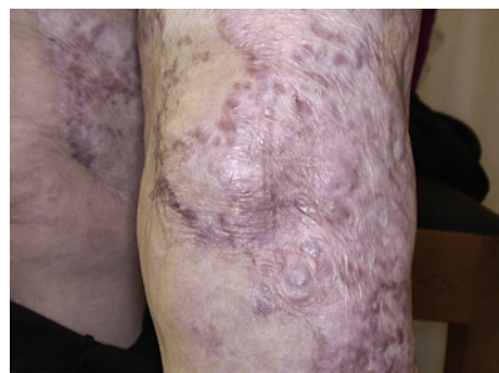
Fig. 2. Elbow right on representation on August 13, 2014.