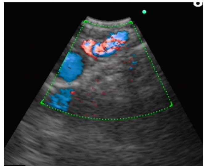
Figure 4. A 1.5-mm diameter small blood vessel in a submucosal lesion examined by endobronchial ultrasound in color Doppler mode.

local obstruction of the bronchial lumen and causing obstructive pneumonia. If the nodule is mistaken for a neoplasm, subsequent biopsy may lead to a large hemorrhage and death by suffocation. Abnormal vessels in the submucosa can be tortuous and dilated, and with a worm-like shape (Fig. 2), sometimes with fork-like 'twigs'. This type of case is easily mistaken for submucosal tumor infiltration, and subsequent biopsies may lead to fatal hemorrhage. As the bronchial cavity is filled with blood and blood clots, it is difficult to find a small mucosal protrusion, or the mucosal protrusion is localized below the subsegmental bronchus and thus cannot be seen by conventional bronchoscopy.