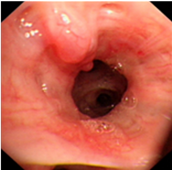
Figure 2. Abnormal vessels are tortuous and dilated, with purple earth-worm-like alterations (black arrow) in the submucosa of the posterior basal segmental bronchus of the right lower lobe.