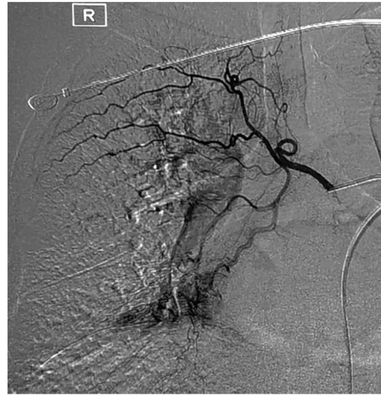
Figure 3. Thickened and disordered lower right bronchial artery shown by bronchial angiography.