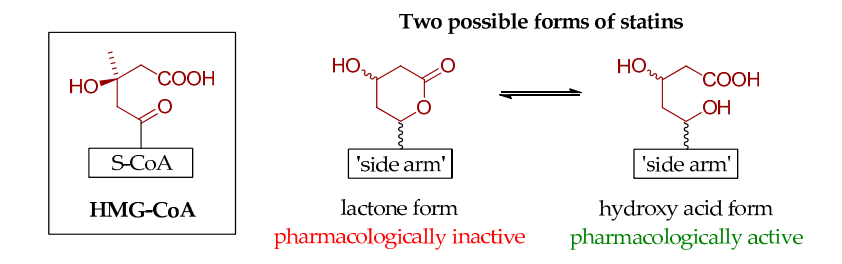
Figure 2. The similarity between structures of HMG-CoA molecule and statins.

Structurally, all statins have a common element (pharmacophore group) (Figure 1) that shows great similarity to the HMG-CoA molecule (Figure 2), thus being the excellent competitive inhibitor of HMG-CoA reductase [6]. With respect to the 'side arms' of most commercially available statins, they constitute partially hydrogenated naphthalene ring, with either the 2-methylbutyrate or 2,2-dimethylbutyrate moiety, and one or two methyl groups located on the opposite sites of the bicyclic ring system. On the other hand, the basis of the structure of synthetic statins is indole (fluvastatin), pyrimidine (rosuvastatin), pyrrole (atorvastatin) or quinoline (pitavastatin) aromatic ring substituted with various groups, including 4-fluorophenyl one, identical for all these structures. Nevertheless, as far as statins are concerned, the history of their isolation, synthesis and further development goes back nearly 50 years, and is briefly described in the next section.