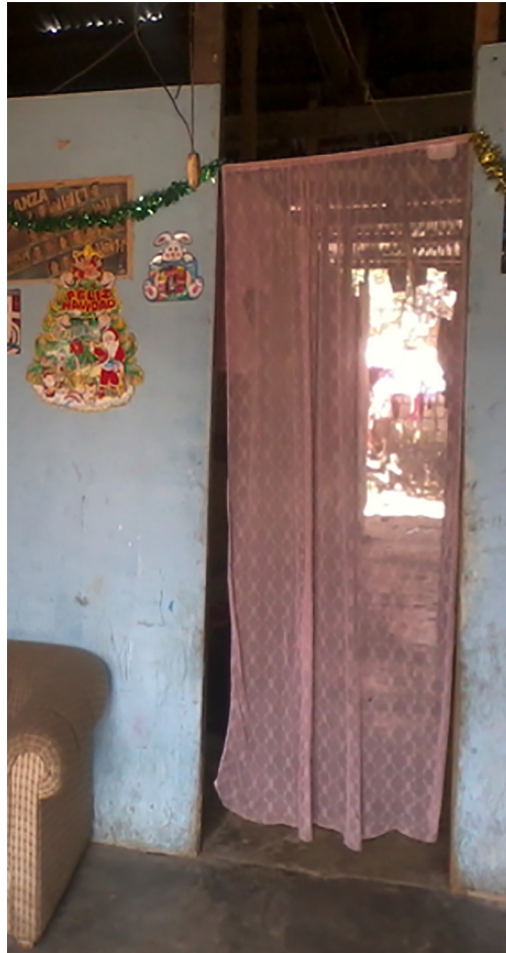
Fig 2. Example of ITC hanging fully extended in doorway.