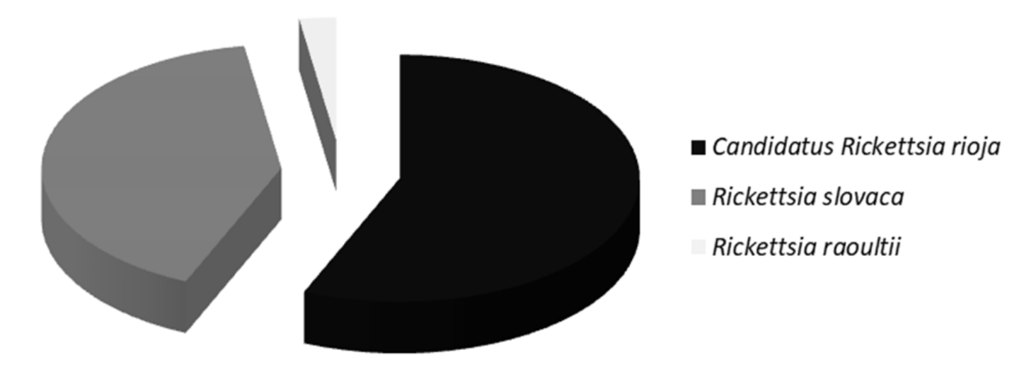
Figure 3. Etiological agents detected in DEBONEL cases.

In summary, diagnoses of infection by ' Ca . R. rioja' (91 cases), R. slovaca (66 cases), or R. raoultii (4 cases) were made in 161 out of 216 enrolled patients, Figure 3.