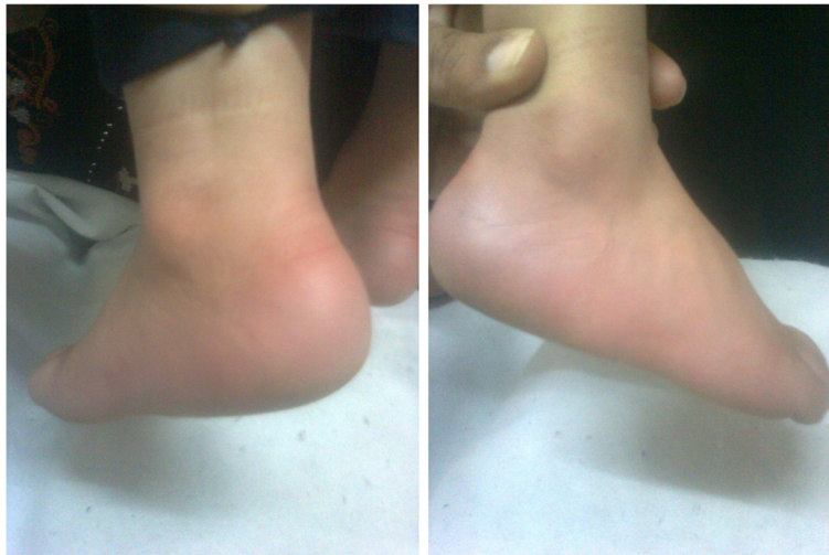
Figure 1 Photography for our case during an episode.

Adult-onset EM has a wide range of age distribution, with most cases occurring in the fifth and sixth decades; in early reports, the median age of onset for early-onset EM was 10 years [5].