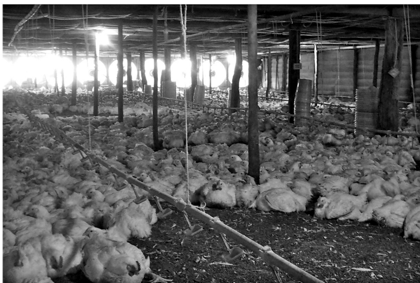
Fig. 1. Housing for 14 000 chickens in rural farm, Thailand, 2016

farms that reportedly used the regimen (Fig. 2). Although chickens were allocated 41 days on these three farms, antibiotic use was halted on day 31. The 10 days without antibiotics represented an attempt to eliminate antibiotics from the chicken meat reaching consumers.