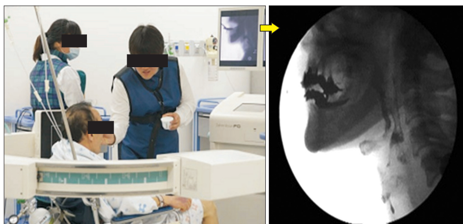
Fig. 1. Videofluoroscopic swallowing study lateral plane view. Each image included the lips anteriorly to the vertebrae posteriorly, and the soft palate superiorly to the 6th cervical vertebra inferiorly.

After the VFSS, the results were assessed by obtaining the MPAS and ASHA-NOMS swallowing tests. The MPAS consists of a 5-point scale, ranging from 1 to 5 as follows: 1, material does not enter the airway; 2, material enters the airway, remains above the vocal folds; 3, material enters the airway, contacts the vocal folds; 4, material enters the airway, passes below the vocal folds and effort is