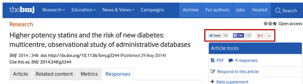
FIGURE 1 Social media mentions and “likes” for Dormuth et al 21 on BMJ website. ( http://www.bmj.com/content/348/bmj.g3244 )