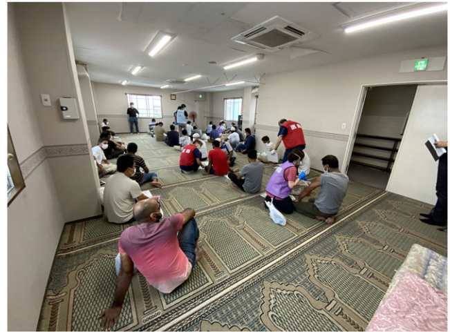
Figure 1. People receiving vaccinations on the third floor of Ebina Mosque (doctors, nurses, and paramedics wore scrimmage vests).

There were two notable aspects of vaccination at the mosque: multilingual support and gender support. For multilingual support, medical questionnaires in Japanese and English were available. Confirmation and questions about vaccination precautions (i.e., history of anaphylaxis) in Japanese, English, Tamil, Urdu, Sinhalese, and Bengali were also posted at the reception. Furthermore, three or four interpreters conversant in several foreign languages were on standby. They could interpret Japanese into not only English but also Bengali, Tamil, Sinhala, and other languages. The interpreters were all volunteers from among the daily worshippers as well as the mosque representative and imams. They interpreted beside the doctors during the initial group explanations and the individual medical interviews. Additionally, vaccine