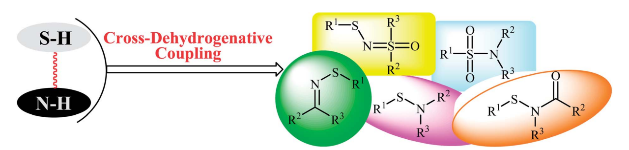
Fig. 2 Synthesis of a variety of sulfur-nitrogen bond-containing organosulfur compounds via cross-dehydrogenative coupling reactions.

Very recently, Yuan's research team developed an efficient synthesis of 2-benzothiazole-sulfenamides 14 via direct aerobic oxidative amination of 2-mercaptobenzothiazole 12 under metal-free conditions.<sup>19</sup> In this transformation, 2,2,6,6-(tetramethylpiperidin-1-yl)oxyl (TEMPO) was utilized as the catalyst and O<sub>2</sub> as the oxidant without any co-oxidant. Solvent has a dramatic role in the reaction and among the various solvents such as MeOH, EtOH, DCM, DCE, DMF, MeCN, EtOAc, toluene, acetone, chlorobenzene, ethylbenzene; MeCN was the