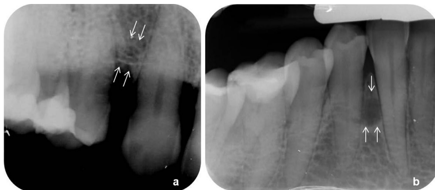
Fig. 2: Periapical radiographs revealed radiolucencies between (a) the maxillary and (b) the mandibular right canine and first premolar teeth.

The postoperative course was uneventful and no recurrence has been recorded during the 18-month follow-up period. At the time of initial examination, the patient gave informed consent for the future use of her data for study.