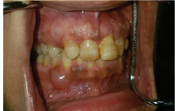
Fig. 1: Two discrete swellings covered by normal to slightly semi-lucent mucosa on the attached gingiva between the maxillary and mandibular right canine and first premolar teeth.

Intraoral examination revealed two fluctuant swellings covered by semi-lucent mucosa on the attached gingiva between the maxillary and mandibular right canine and first premolar teeth, respectively, each measuring approximately 1cm in diameter (Fig. 1). The adjacent teeth were vital with a normal gingival sulcus depth and no bleeding on probing. Both maxillary lateral incisors were congenitally missing, while the right first premolar had a lateral-access class II amalgam restoration. Periapical radiographs revealed at the respective sites between the roots of the canine and first premolar teeth areas unilocular radiolucencies (Fig. 2). No other abnormality was clinically or radiographically evident.