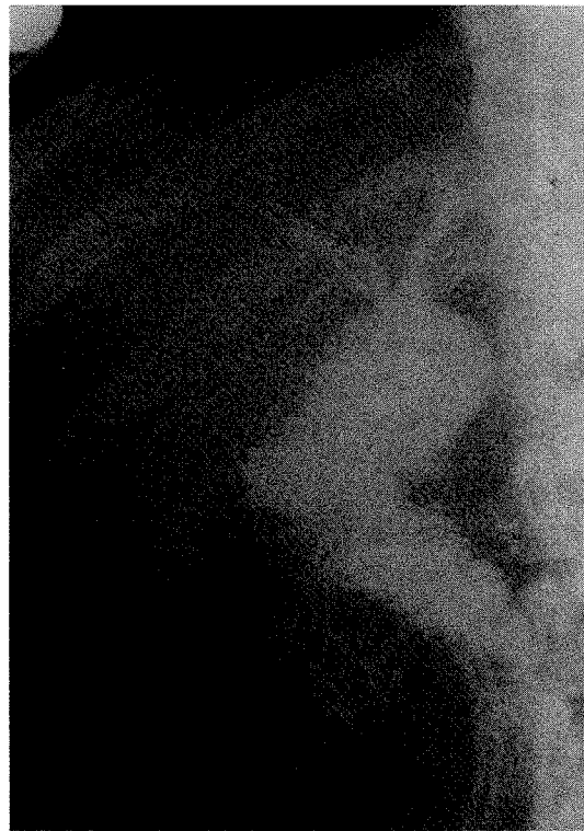
FIGURE 3 Cholangiography of a right and left hepaticojejunostomy with good result.

cases, up to 12 months of stenting can be necessary [22,32,33]. The authors who use stents selectively consider that they are unnecessary if a tension-free anastomosis with wide stoma and good blood supply is accomplished. However, they use tubes in case of higher and more complex strictures, specially those with unsuccessful previous repairs. In this study, transanastomotic tubes were used selectively and were preferentially exteriorized through the excluded jejunal loop (like a Witzel jejunostomy) (Fig. 3), and exceptionally by the transhepatic route (Fig. 4). Data from this study (and other studies in which the selective use of tubes is adopted) don't permit valid conclusions concerning the influence of stents in outcome, since they were used only in complicated cases.