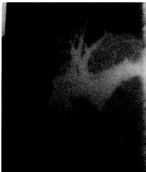
FIGURE 1 Distribution of the 39 patients according to the Bismuth classification. Type I: 8 cases.