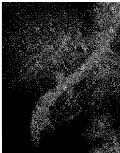
FIGURE 1 Continued. Type III: 7 cases