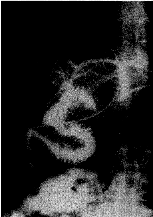
FIGURE 4 Cholangiography of a hepaticojejunostomy with mucosal graft (Smith's technique).

Caution is necessary to compare the results of surgical reconstruction from different institutions. Differences related to the location of the stricture, the moment of the repair (when the injury occurs or later on), the number of previous attempts of repairs, the presence of complications (biliary cirrhosis, portal hypertension, cholangitis), as well as diverse definitions of "good results" can lead to conflicting conclusions. One of the criteria to define "good results" in this study was alkaline phosphatase levels less than two times the normal values. Although it can be considered a rigid criteria, the authors think that it is valid since persistently elevated alkaline phosphatase levels denote some degree of cholestasis, and patients with this feature are at increased risk of developing cholangitis or biliary cirrhosis later on [11,12]. There was only one confirmed case of biliary cirrhosis (a patient with more than one repair). Two of the patients with one repair had persistently elevated alkaline phosphatase. Hepatobiliary