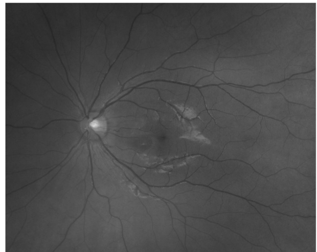
Fig. 1 Fundus photography of the left macula. The image displays a delicate teardrop-shaped lesion nasally to the fovea.

The signs and symptoms of our patient were consistent with acute macular neuroretinopathy (AMN). The exact pathophysiology of AMN is unknown, but several risk factors have been identified; the most common associations are non-specific flu-like illness or fever and use of oral contraceptives [1]. The present case further expands the spectrum of possible associations. To the best of our knowledge, AMN following COVID-19 vaccination has not been previously published, and a coincidental finding cannot be ruled out. However, there are case reports of AMN in the course of COVID-19 infection [2–4]. An association between AMN and both