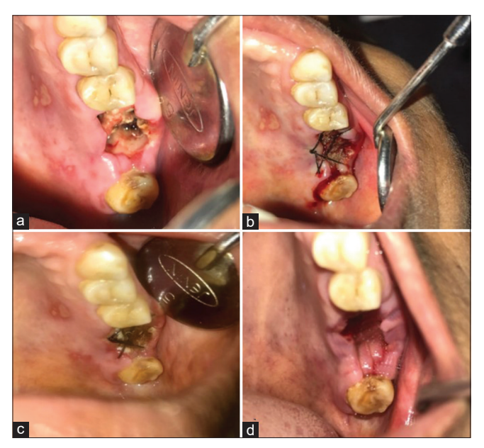
Figure 1: Alvogyl group. (a) = Day 1 (at the time of presentation), (b) = Day 1 (after alvogyl and suturing), (c) = Day 3 postoperative, (d) = Day 10 postoperative

Patients reporting with postextraction pain, who fit the criteria for dry socket, were selected for this study after an informed consent. Patients who did not consent for the study and patients below 14 and above 60 years of age were excluded from the study. A detailed history consisting of chief complaint, relevant past medical history, drug history/allergy, and personal history were recorded for every patient. Patients were examined both symptomatically and clinically. A total of thirty patients were included in the study based on the prevalence of dry socket (0.5%-5.6%)[8] and were randomly divided into two Groups (Group A and Group B), with 15 patients in each group using simple randomization. The participants in Group A (control group) were treated for dry socket with gentle irrigation with warm saline. After isolation and debridement, the socket was then packed with alvogyl and sutured using 3.0 Mersilk with a figure of eight to avoid immediate elimination