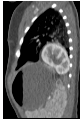
Figure 2: Sagittal reconstruction of computed tomography thorax demonstrates an intrathoracic kidney

After weight measurements, 21MBq of ^{99m}\text{Tc} -MAG-3 and 8.2 mg of furosemide were administered through a cannula at the start of dynamic imaging (time-0). Dynamic image acquisition was undertaken at a rate of 20 s per frame for 30 min (90 frames in total). The data were analyzed using the GE Discovery Xeleris view 3 functional imaging workstation software (Medical systems Milwaukee, Wisconsin, 2000).