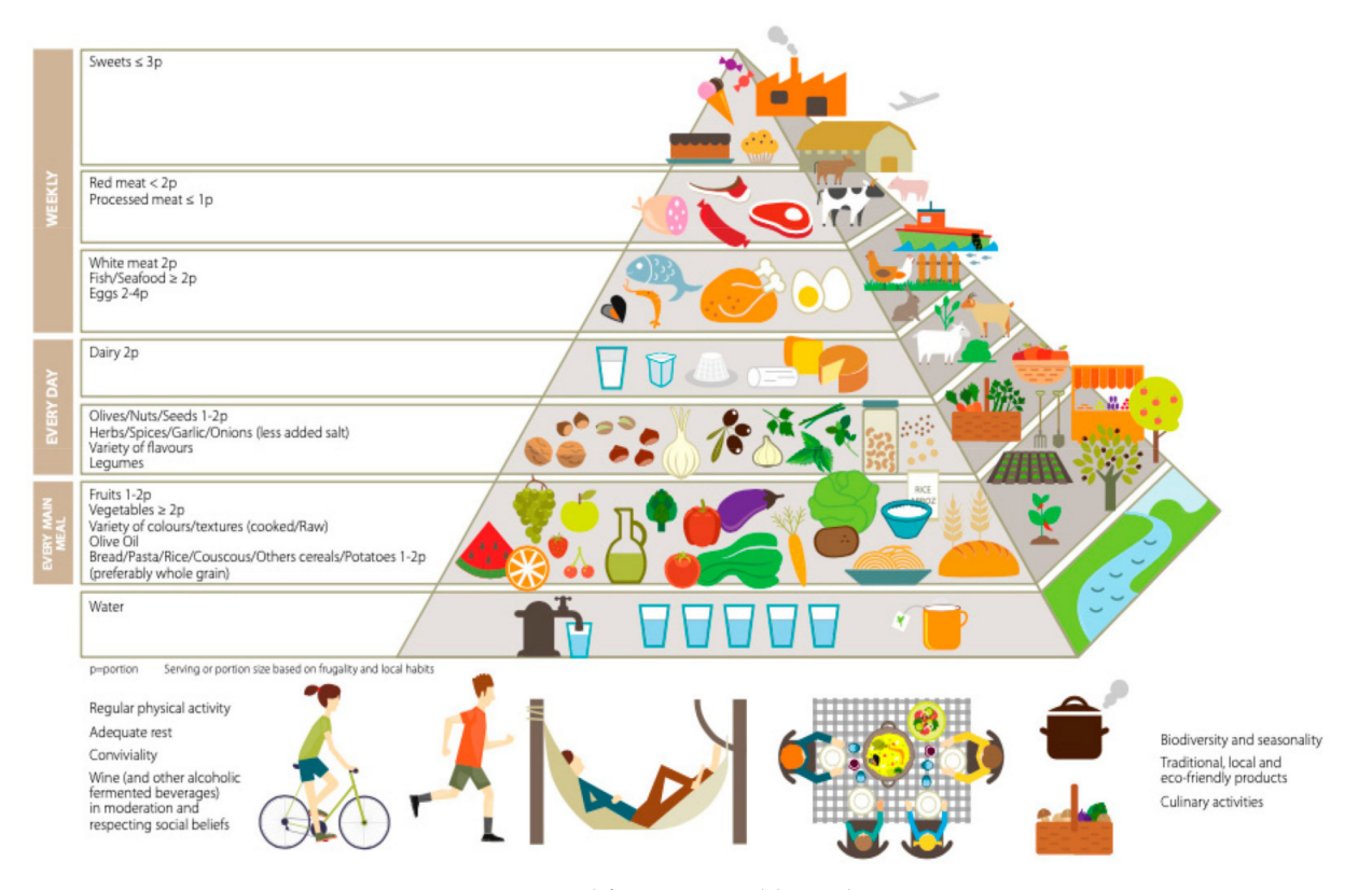
Figure 1. New Pyramid for a Sustainable Mediterranean Diet.

dietary pattern and physical activity, seems to have a pivotal role [48,49]. A chronic low-grade inflammatory status, which induces microglial chronic activation leading to proinflammatory cytokine production and neuronal apoptosis, is recognized as a key factor in the pathogenesis of AD and other NDDs [50]. The Whitehall II prospective cohort study (2017) showed how a pro-inflammatory Western diet, which increases serum interleukin-6 (IL-6) levels, may accelerate cognitive dysfunction [51]. Evidence supports the role of the Mediterranean diet (MedD) in the primary and secondary prevention of non-communicable chronic diseases (NCDs) such as cardiovascular disease, AD and dementia [52–55]. The high intake of different types of fruit, seasonal green leafy vegetables, extra-virgin olive oil (EVOO) (cold pressed), fresh blue fish, whole grains, legumes, nuts, spices and a low intake of alcohol such as red wine, with small quantities of red meat, eggs and dairy products, defines the Mediterranean dietary pattern [48,56,57]. The most recent revision of the Mediterranean Diet Pyramid (MDP), in addition to graphically summarizing all the nutritional aspects, also emphasizes sociocultural, environmental and sustainability issues, which are essential components of the concept of well-being >(Figure 1) [58].