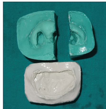
Figure 4: Three sections of sectional working cast