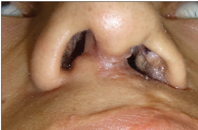
Figure 1: Post-septorhinoplasty nasal architecture

The second and third segments of the split cast were poured with grooves for proper orientation of the sections [Figure 4]. Wax pattern for nasal stent was fabricated. A suction tip segment was used to provide for nasal patency. The rubber suction tip was cut, tried on model, length was adjusted, and positioned centrally in the left nasal cavity on the working cast using modeling wax to make the stent hollow. A stainless wire hook was adapted over the columella and embedded in the stent wax pattern. Split mold was assembled and autopolymerizing acrylic resin was flown in the mold. The prosthesis was retrieved after completion of polymerization. The stent was characterized to match the color with adjoining skin [Figure 5]. All sharp edges and projections were smoothed and the surface was highly polished to prevent injury to the nasal mucosa and the growth of microorganisms. The nasal stent was delivered to the patient and its accuracy was checked by asking the patient to close right nostril and breathe forcibly through the left nostril [Figure 6]. The stent was retained in situ and the inhalation and exhalation