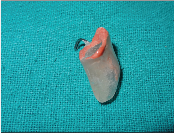
Figure 5: Characterized nasal stent with attached wire hook

process occurred without hindrance. Instructions were given regarding the use and maintenance hygiene of the stent. After insertion, the patient was recalled at 48 h and 1, 3, and 6 months for periodic follow-up [Figure 7].