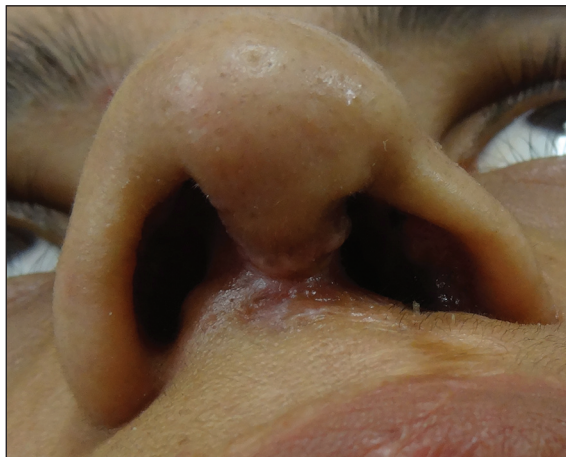
Figure 7: Post septorhinoplasty nasal architecture at 6 months follow-up