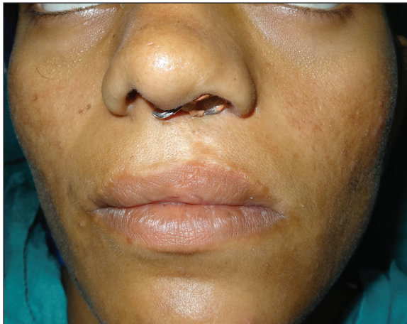
Figure 6: Nasal stent in situ