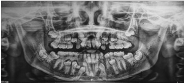
Figure 4: Orthopantomogram of the patient revealed the presence of multiple impacted and unerupted teeth in both maxillary and mandibular dentition along with failure of root completion