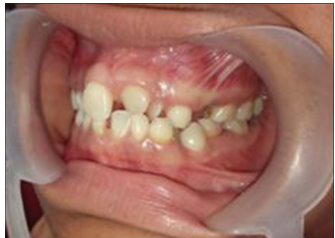
Figure 3: Lower arch view – Malocclusion evidenced by anterior deep bite coupled with areas of crossbite