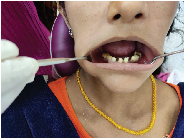
Figure 8: Intraoral view of lower arch showing spacing and open contact points