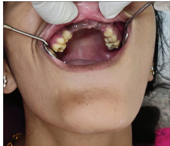
Figure 7: Intraoral view yielded the presence of multiple retained deciduous teeth, multiple missing permanent teeth and malocclusion. The canines and molar teeth pertaining to the upper arches exhibited marked mottling and a rough scratchy surface

and Hospital, with the chief complaint of multiple missing teeth. On extraoral examination, nothing significant was found [Figure 6]. Intraoral examination yielded the presence of multiple retained deciduous teeth, multiple missing permanent teeth and malocclusion. The canines and molar teeth pertaining to the upper arches exhibited marked mottling and a rough scratchy surface [Figure 7], 52 and 65 were retained in the upper arch and 73, 74, 84 and 85 were retained in the mandibular arch. 11, 12, 14, 15, 17, 18 and 21, 22, 24, 25, 27, 28 in the maxillary arch were absent. 32, 33, 42, 43, 34, 44, 37 and 47 in the mandibular arch were absent. Spacing in lower arch and open contact points involving maxillary posterior teeth were noted, especially between 26 and 65 [Figure 8]. OPG revealed the presence of multiple unerupted/retained deciduous and permanent impacted teeth along with teeth where root completions were not evident [Figure 9].