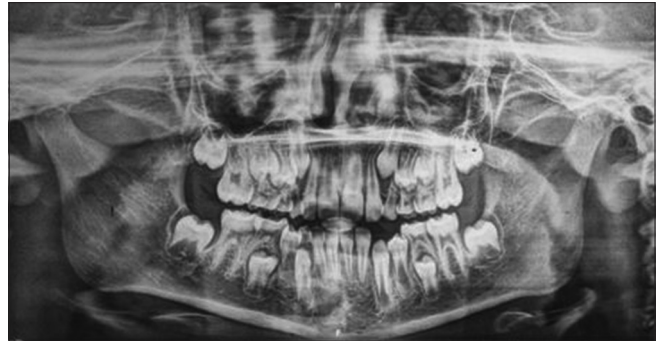
Figure 5: Orthopantomogram of the younger sister of the patient showing unerupted and impacted teeth and teeth with incomplete root formation