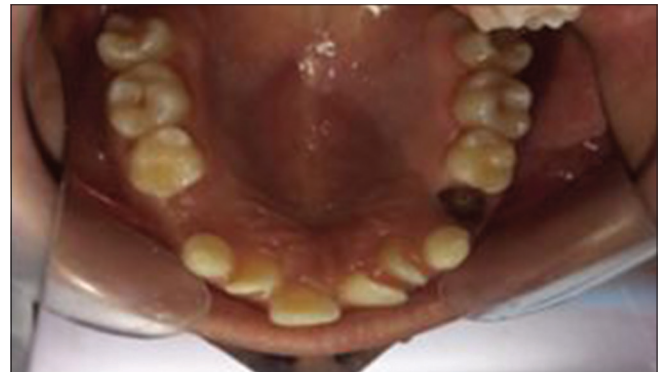
Figure 2: Intraoral view showing the presence of multiple retained deciduous teeth, noneruption of permanent successors, along with retained root