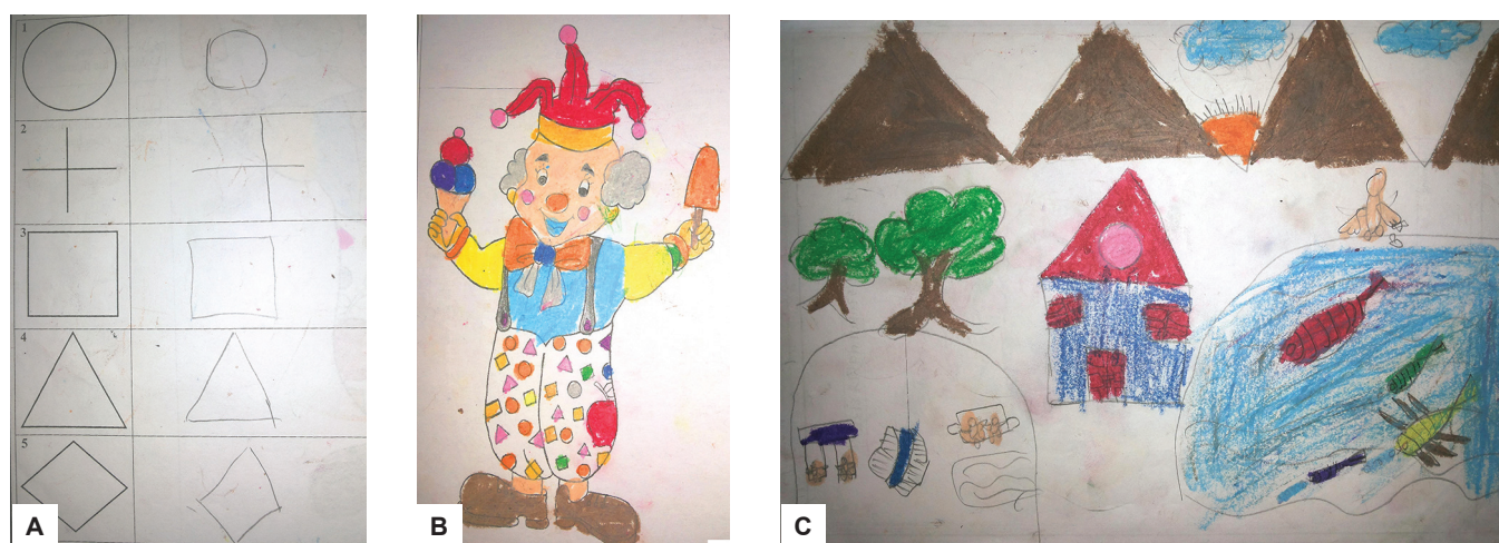
Figs 3A to C: (A) Geometric copy drawings done by a 9-year-old female patient displaying Frankl's positive behavior during dental treatment, showing clear, bold, age-appropriate pattern; (B) neatly completed coloring task using multiple colors by the same patients as in 3A; and (C) clarity of thought and proportion in detailing with multiple human figures drawn by the same patient as in 3A and 3B

are in obvious contrast to the ones drawn by another 9-year-old female patient with Frankl's positive behavior (Figs 3A to C).