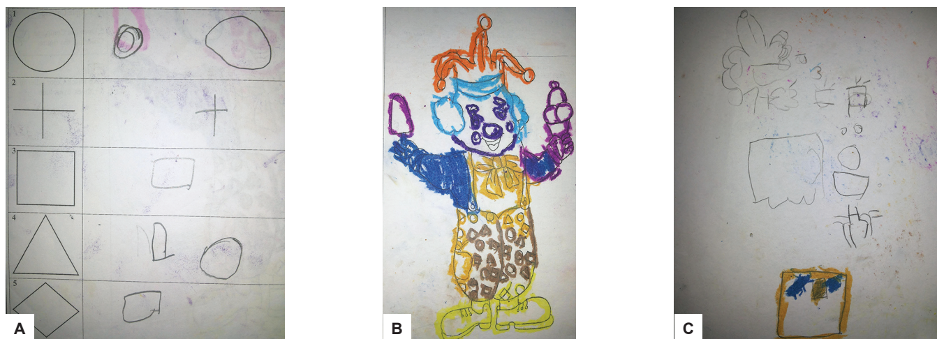
Figs 2A to C: (A) Geometric copy drawings done by a 9-year-old female patient displaying Frankl's negative behavior during dental treatment. These are at the level of copy drawing expected from 4½- to 5½-year age group; (B) coloring task left incomplete by the same patient as in 2A; and (C) no clarity of thought, disjointed figures, and no resemblance to any object in freehand pencil drawings done by the same patient who has drawn in 2A and 2B