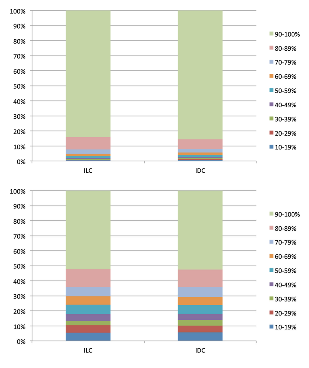
Fig. 1 Percentage of estrogen receptor (ER) expression in ERpositive invasive lobular (ILC) or invasive ductal (IDC) breast cancer