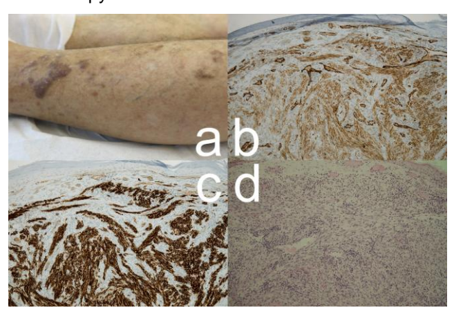
Figure 5: Case #2: a) Nodules on the lower left leg and foot. Left Lower leg with patches and plaques of classical KS; b) Immunostaining for CD31; c) Immunostaining for CD34; d) Immunostaining for HHV-8

and siderophages were noted. The vascular parts within papillary bodies showed a spindle cell type. Endothelial were positive for CD31, podoplanin, and HHV-8 and partially CMYK for immunohistochemistry. The mitotic rate was about 10 to 20% with Ki67-staining. Diagnosis: Classical KS is shifting from patch to plaque stage.Laboratory findings: Lymphopenia of 12% (normal range: 25-45%), erythrocytes 4.29 (4.6-6.2Tpt/l), Hb 7.9 (8.6-12.1mmol/l), \(\mathbb{G}\)-2-microglobulin 2.6 (0.8-2.2mg/l), 79.8 CD3+/CD4+-T-helper cells (35-66%),CD3+/CD8+-T-suppressor cells 11.1 (17-46%), ratio helper/ suppressor cells 7.19 (1.0-2.3), HIV test Imaging: Computerized tomography demonstrated a pulmonary nodule of 0.5cm in diameter dorsobasilar on his right side. Several Hilary and pulmonary lymph nodes with a diameter < 1 cm. Ultrasound abdomen/ groins: Tumor-like growth in the left groin and an atypical lymph node (19 mm). MRI of the head excluded any tumour spread. The patient was referred to the Department of Radiology for radiotherapy.