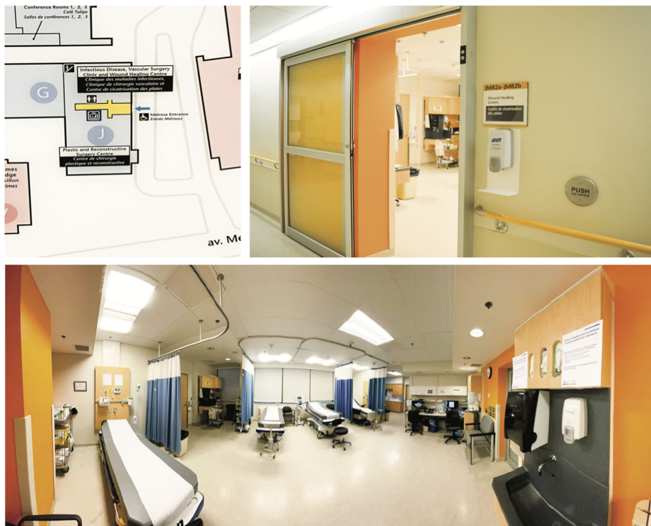
FIGURE 1 Structure of The Ottawa Hospital Limb-Preservation Clinic. The clinic is located in the same hallway as outpatient clinics for the Divisions of Vascular and Endovascular Surgery, Infectious Diseases, and Plastic and Reconstructive Surgery. The outpatient clinic for the Division of Orthopaedic Surgery is located just adjacent to it. The clinic space includes a large room that has three stretcher bays, one chiropody chair, a staff computer station, and an office equipped with telehealth technology (located between the chiropody chair and the interprofessional staff computer station to the left of the clinic)

A full-time specialty vascular wound care nurse and a number of part-time consulting surgeons staff the clinic. The surgeons affiliated with the clinic have expertise in open and endovascular lower limb revascularisation, soft tissue coverage and reconstruction, correction of structural foot deformities and biomechanical orthopaedic problems, minor and major lower limb amputations, and simple and complex debridement procedures. All patients with signs or suspicion of infection are seen by the infectious diseases service while most of those with suspicion for structural foot deformities are seen by foot and ankle orthopaedic surgeons or referred for orthotics.