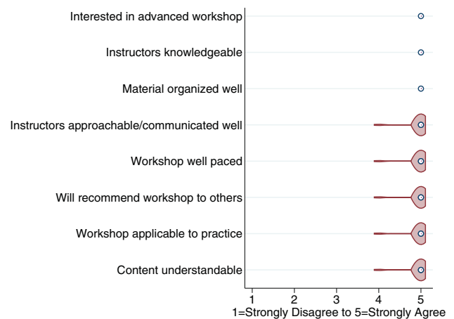
FIGURE 4 Violin plot of participants' ( n = 20 nurses and n = 1 family medicine physician) evaluation of the workshops on complex lower limb wound care provided by the clinic. Violin plots are modified box plots that add estimated kernel density plots to the summary statistics displayed by box plots. Responses were rated on a 5-point Likert scale ranging from 1 = strongly disagree to 5 = strongly agree

This study is one of the first to provide a detailed description of the structure and processes of a multi-specialist,