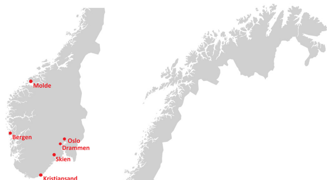
Figure 1 Map of Norway with the active centres of recruitment per August 2018 marked in red.

for 2–4 weeks. 6 Previous studies have shown that 2 weeks of oral doxycycline and intravenous ceftriaxone are equally effective for LNB with painful radiculitis or cranial neuritis and probably also for LNB with symptoms from the central nervous system (myelitis and encephalitis). 7–9 Arguments for choosing oral doxycycline are that it is inexpensive and convenient, is found to penetrate the blood–brain barrier and give adequate concentrations in the CSF and is effective against coinfections with other tick-borne agents. 10 11