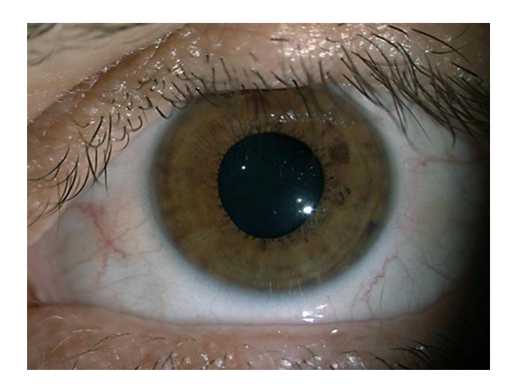
Fig. 1. Unilateral mydriasis that did not resolve completely following pilocarpine 1% eye drop administration.