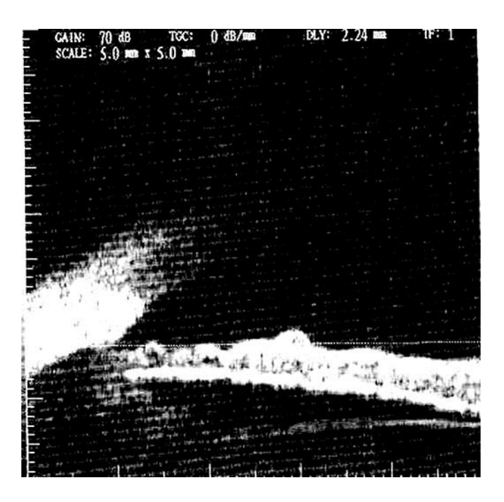
Fig. 3. Lisch iris nodules and narrow angle in our patient as evidenced by ultrasound biomicroscopy.

Mantelli et al.: Unusual Case of Angle Closure Glaucoma in a Patient with Neurofibromatosis Type 1 \,