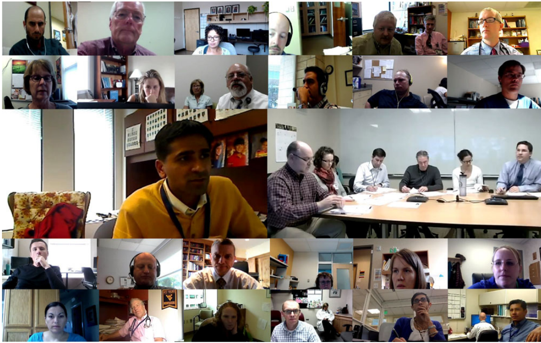
Figure 1. Snapshot of a University of Washington and Mountain West AIDS Education and Training Center (MW AETC) Project ECHO (Extension for Community Healthcare Outcomes) telehealth session; a community human immunodeficiency virus medical provider (large panel, left) is presenting one of their cases to a multidisciplinary team of academic specialists (large panel, right) and a network of their peers (surrounding smaller panels). Providers join the weekly session simultaneously via interactive video using a desktop, laptop, mobile device, or other video-conferencing system.

associated with level of participation, we performed ANOVA to examine whether these items were significantly associated with length of time between first and last assessment.