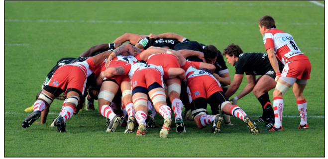
Figure 3 Herpes gladiatorum was first described in the 1960s, and is mostly associated with contact sports such as rugby and wrestling.

Other infections recorded include impetigo ( Staphylococcus aureus , Streptococcus pyogenes ), ringworm due to Trichophyton tonsurans , and viral infections such as chickenpox from cases of shingles.