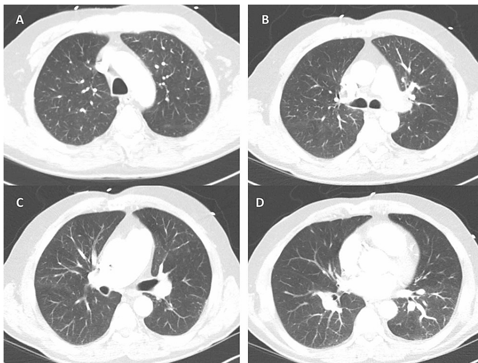
FIGURE 2: Chest CTA with no lung infiltrates present