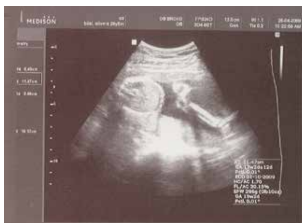
Figure 2. Ultrasound examination: gestational age 116/7 gw; FI/AC 0.30; asymmetric IUGR (3 weeks); normal ultrasound morphology of placental tissue and amniotic fluid

sult maternal biochemical serum screening (Triple test) during second trimester of pregnancy showed high risk of chromosomopathies and it was indication for cytogenetic analyses (early amniocentesis). Result of cytogenetic analysis of amniotic cells showed abnormal karyotype-triploidy and DNA (PCR) analysis discovered Type II (Digyny), with extra set of haploid chromosomes of maternal origin.