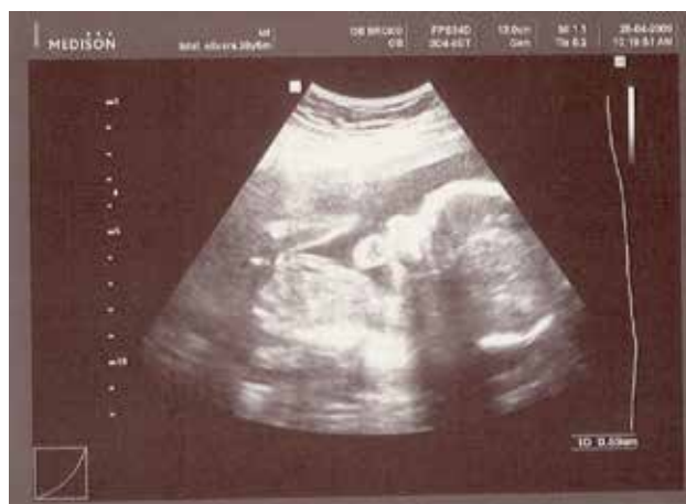
Figure 1. Ultrasound examination: asymmetric IUGR of the fetus and micrognathia

Ultrasound examination revealed asymmetric intrauterine growth restriction. Ultrasound screen and re-